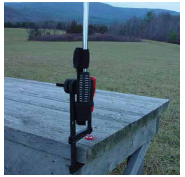
To fit an umbrella use the velcro straps, as shown, and mount the clamp using two knobs.