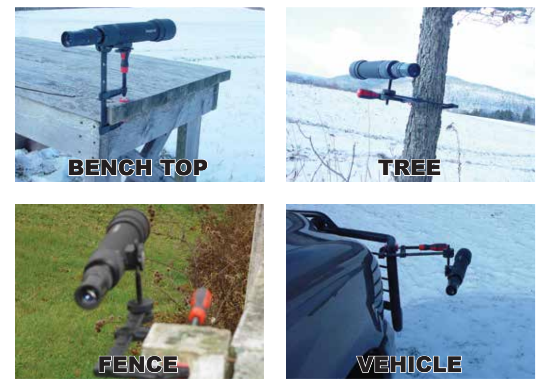
visit our website: www.hyskore.com